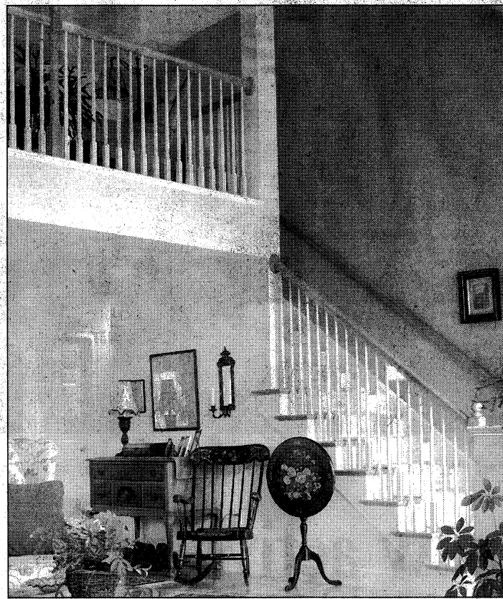
Stairs lead to an open loft area.

Country Hills has a nice, neighborhood feel where residents greet one another and make time to stop and chat. The location is truly special. Even as the neighborhood maintains its serene pastoral feel, there is nearby shopping in historic downtown Exeter, and golf at Apple Hill or Kingston Fairways, just five minutes away. All of the conveniences of Route 101 are