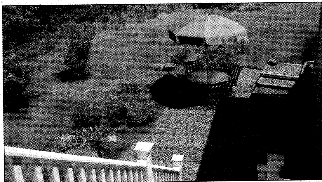
A small patio off the back deck provides a nice dining area.